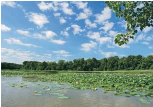
Old Woman Creek estuary

Copies of this publication are available from the Ohio Department of Natural Resources, Division of Wildlife, 2514 Cleveland Road East, Huron, Ohio 44839