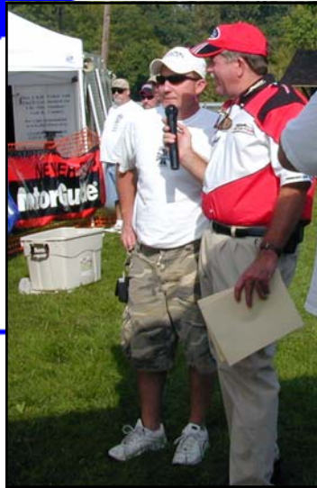
Photos from the 2005 Ohio Bass Classic Indian Lake