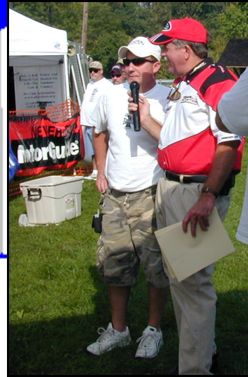
Photos from the 2005 Ohio Bass Classic Indian Lake