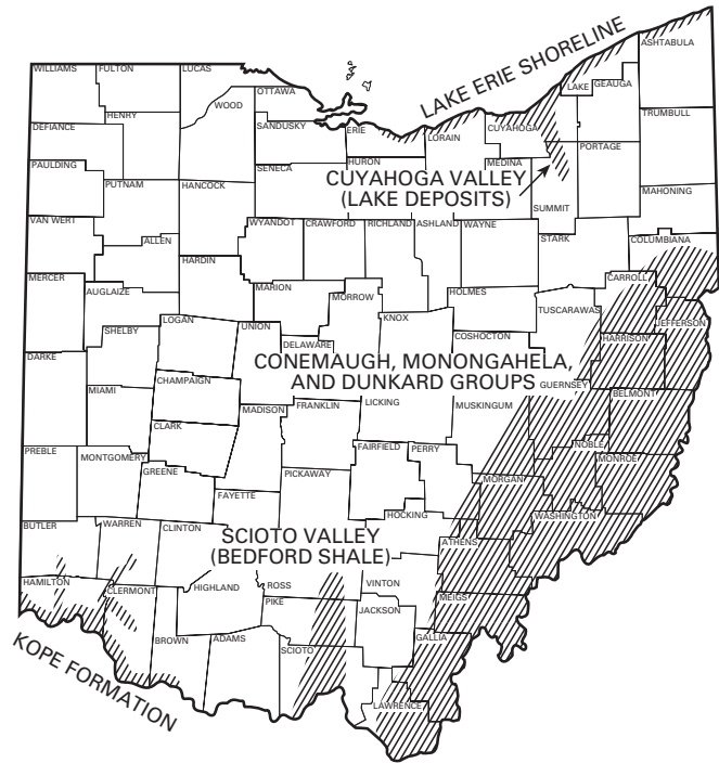
Areas of Ohio subject to severe slope failure.

The valley of the Cuyahoga River between Cleveland and Akron, in Cuyahoga and Summit Counties, is well known for rotational slumps in clays and silts deposited in lakes formed when glaciers of the Pleistocene Ice Age blocked various segments of the valley. The modern Cuyahoga River has cut through these deposits, leaving steep bluffs of unstable sediments along the valley walls. Many of