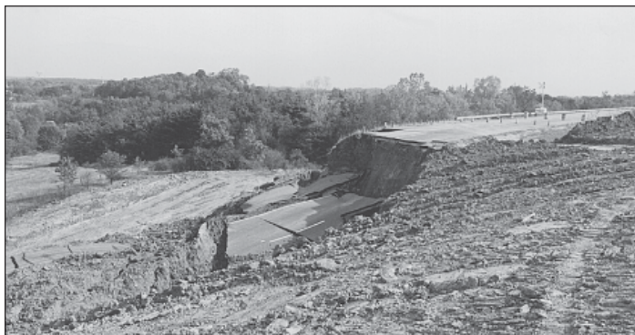
Landslide in westbound lanes of I-70 near New Concord, Muskingum County, 1986.