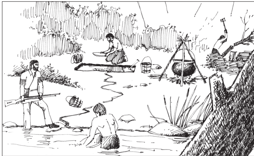
Depiction of early salt making along Little Salt Creek at the Scioto Saline using methods employed by Native Americans and early pioneers.